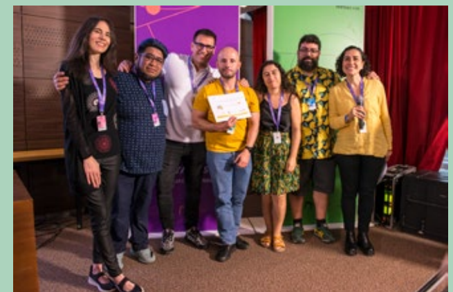
CHOCÓ: LA TIERRA Y LOS MONSTRUOS winner of LA LIGA 2022 award