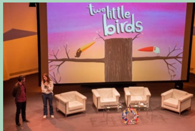
TWO LITTLE BIRDS , winner of the LA LIGA 2018 award, participating in QUIRINO AWARDS