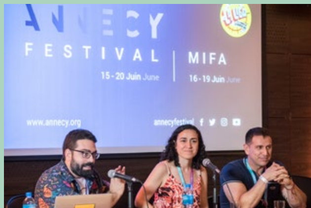
Presentation of ANNECY as “FRIEND OF LA LIGA” at VENTANA SUR 2019

Since 2019, Annecy Festival was incorporated as “Amigo de La Liga” (Friend of La Liga), an alliance that allows to bring Iberoamerica at an international level.