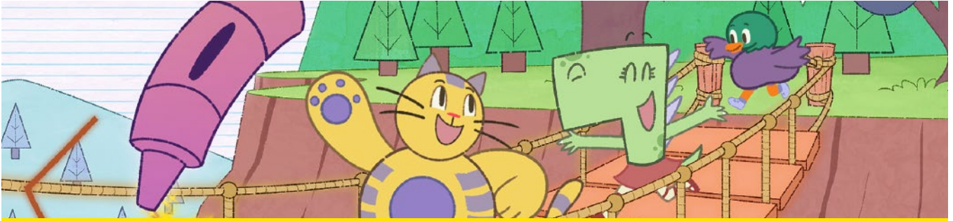
TV SERIES - Selected from Animation! Mentoring Program for Female Creators